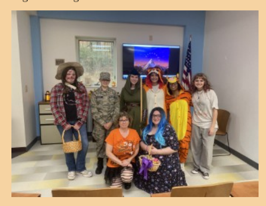
TAB Trick or Treat