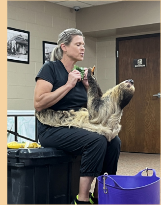
Children were thrilled with the Wild World of Animals show!